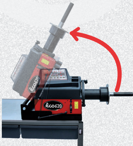
Space-saving tilting measuring unit

EXTREMELY COMPACT. IDEAL FOR INSTALLATION ON VANS FOR MOBILE SERVICE, ON WORKBENCHES OR IN SMALL PLACES